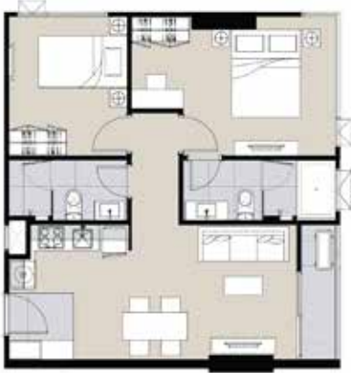
B1, 2 Bedrooms 60.5 SQ.M.