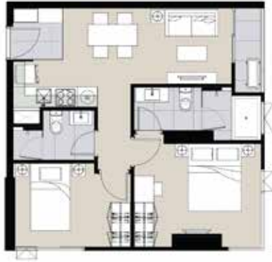
B2, 2 Bedrooms 54 SQ.M.