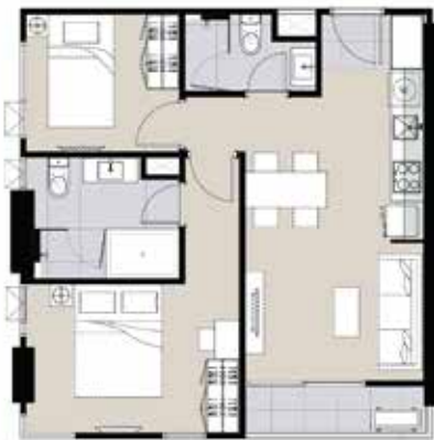
B3, 2 Bedrooms 55 SQ.M.