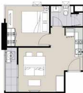
A1, 1 Bedrooms 34 SQ.M.