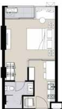
S1, 1 Bedroom 29.5 SQ.M.