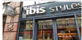
LIVERPOOL ONE 5 Mins Walk