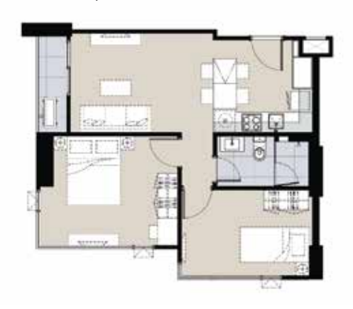
B2, 2 Bedrooms 53.5 SQ.M.