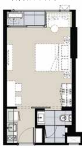
S5, Studio 30 SQ.M.