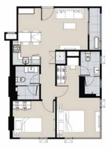
C2, 2 Bedrooms 60 SQ.M.