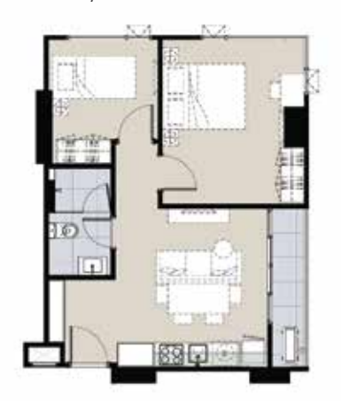
B1, 2 Bedrooms 50 SQ.M.