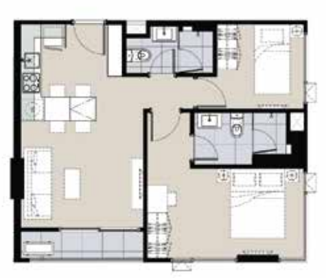
C1, 2 Bedrooms 57 SQ.M.