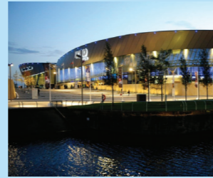
A Echo Arena