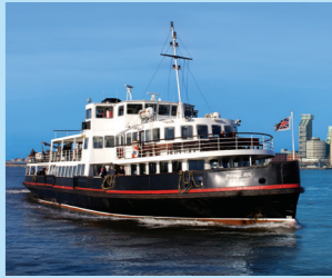
L Mersey Ferries