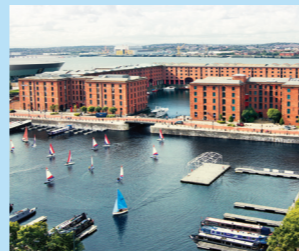
D Albert Dock