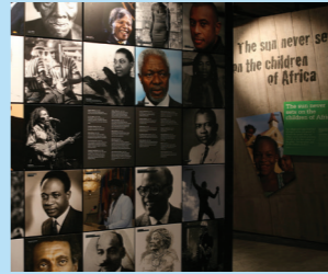
G International Slavery Museum