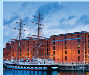
F Merseyside Maritime Museum