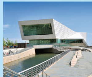
H Museum of Liverpool