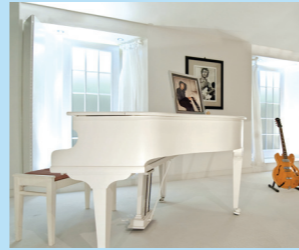
C J The Beatles Story