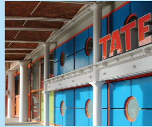
E TATE Liverpool