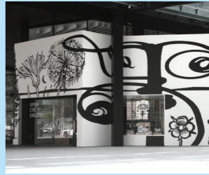
I Open Eye Gallery