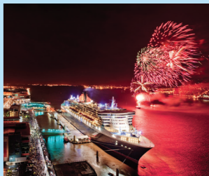
M Liverpool Cruise Terminal