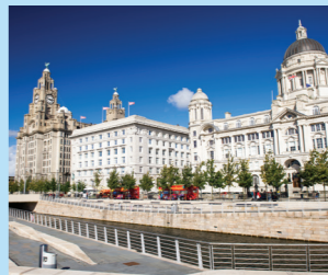
K The Three Graces